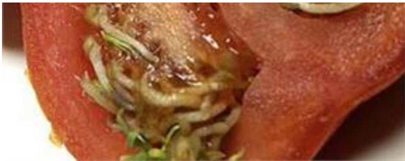
(13) Signs That Your Body Is Fighting Cancer (Photos)