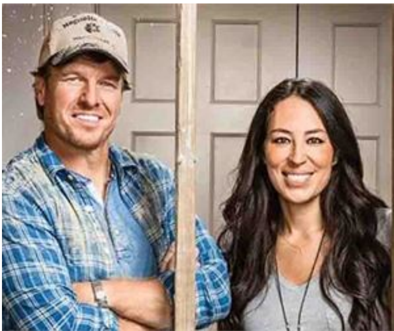
After Weeks Of Rumors, Joanna Gaines Comes Clean