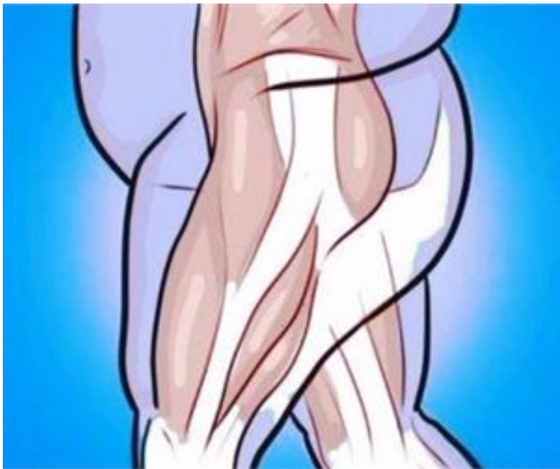
This is How Older Women Lose Weight Fast